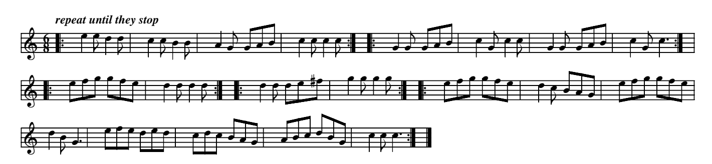
Upon a Summer's Day (Playford 1651) (upon_sum.mid)