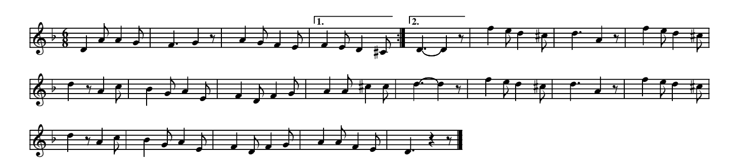
Chirintana (Domenico ?) (Chirinta.mid)