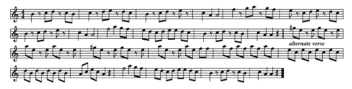
Maltese Bransle (pre 1600?) (Maltese.mid)