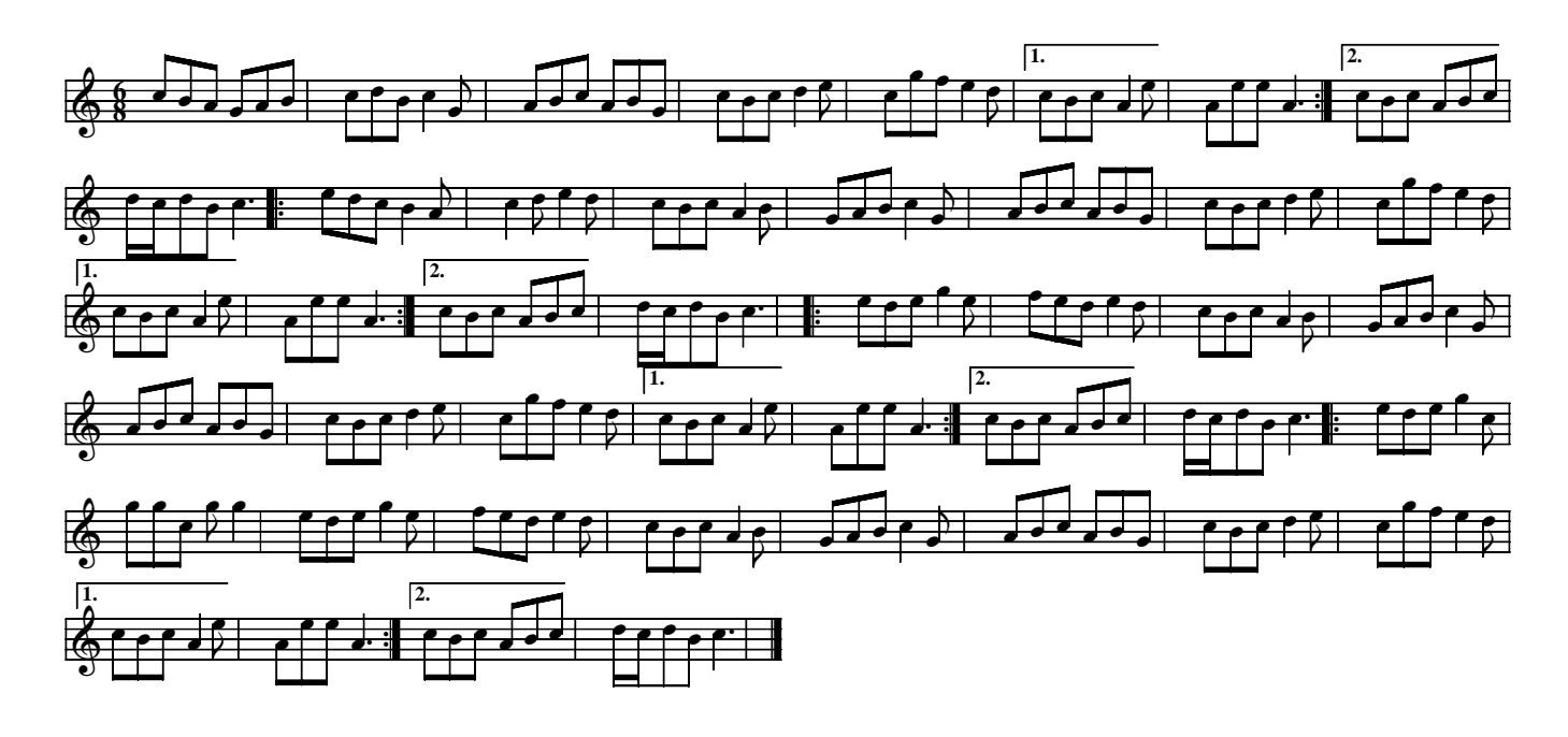
Strip the Willow (?) (Strip_wi.mid)