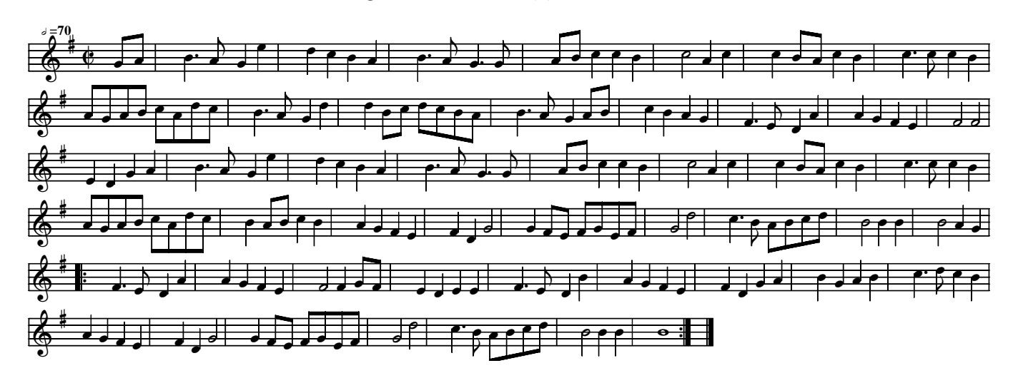
\pmb{Rufty\ Tufty\ (Playford\ 1651)}\ (rufty\_1.mid)\\