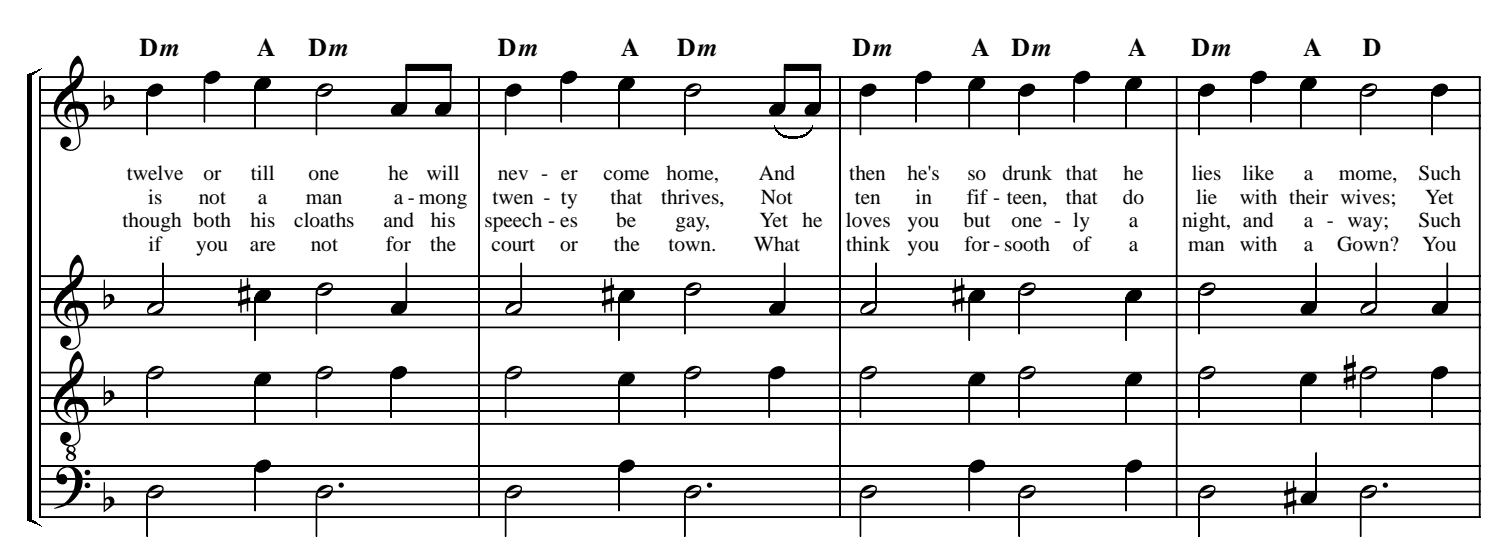
English Ballads and Songs page 2