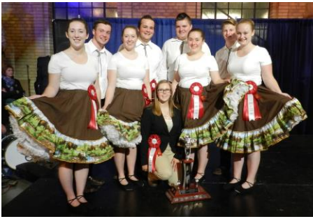
OAC 2020 Buffalo's