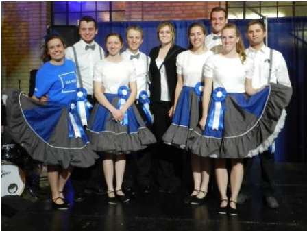
OAC 2018 Timberwolves